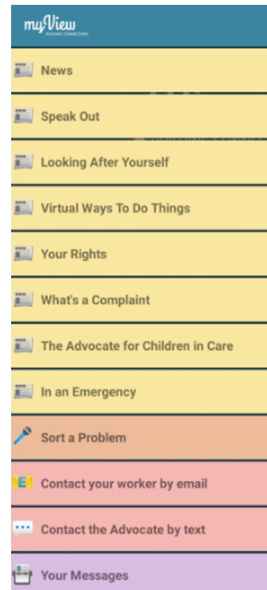
...for Advocacy & Complaints